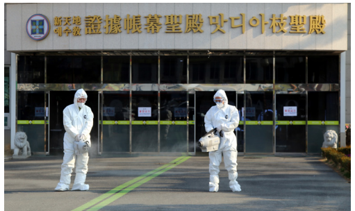
Disinfection carried out on church premises