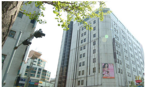
Shincheonji Headquarters in Gwacheon