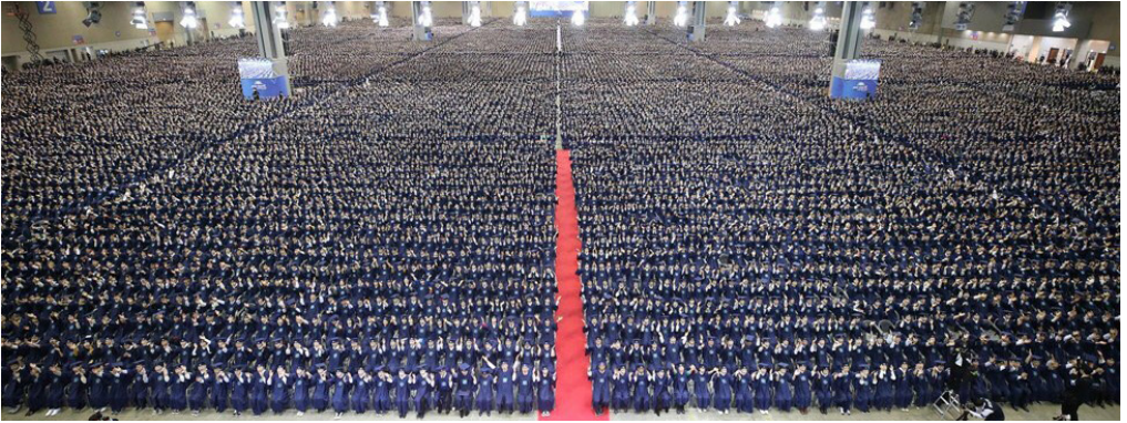
Graduation ceremony in November 2019