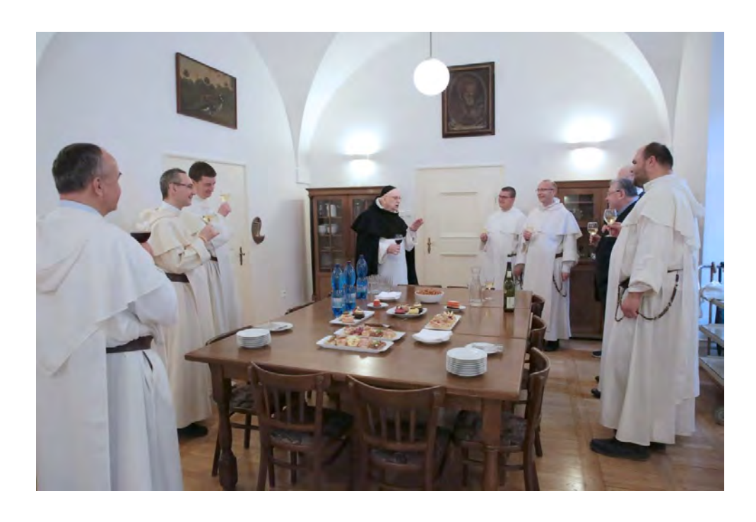
New refectory of the Dominican Priory of St. Giles.